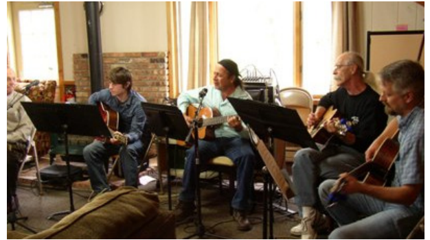
Willmar guitar group, "3 or 4 Amigos", performs for a rapt audience such favorites as "Ave Maria" and "La Bamba."