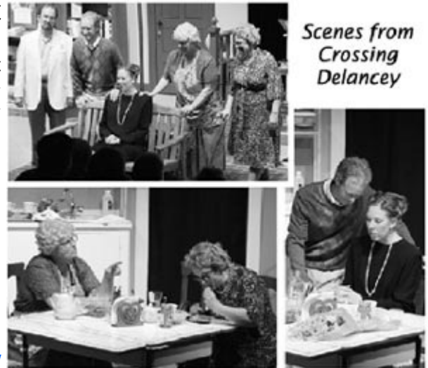
Scenes from Crossing Delancey

Information for this article is used by permission from the PPAC web site.