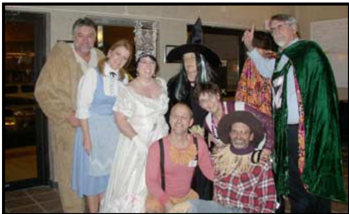
Above: The crew from New London