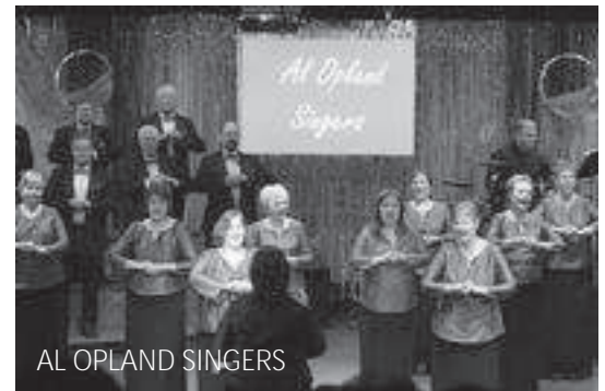
AL OPLAND SINGERS

This choral group started performing in 1978 and continues to impress audiences at the Pipestone Performing Arts Center. The spring show, titled "We're Singing Your Songs," runs two weekends, April 13-15 and April 20-22. Showtimes include Fridays & Saturdays at 7:30 pm, and Sundays at 3:00 pm. For tickets and more information, check: www.pipestoneminnesota.com/artscenter/