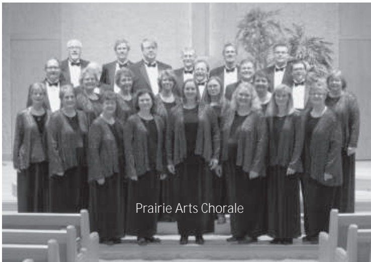
Prairie Arts Chorale