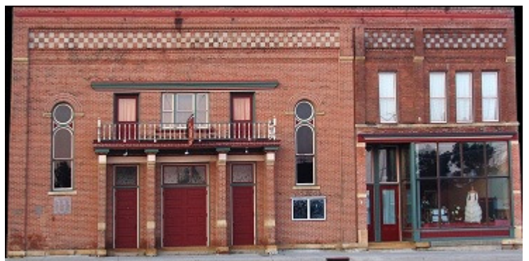
Lake Benton Opera House

Granite Area Arts Council , Granite Falls, $7,500 to replace their upper windows.