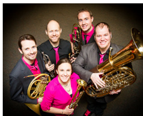
Copper Street Brass

Montevideo Schools , $2,000 for a senior class trip to the Guthrie Theatre to see Shakespeare's "A Midsummer Night's Dream".