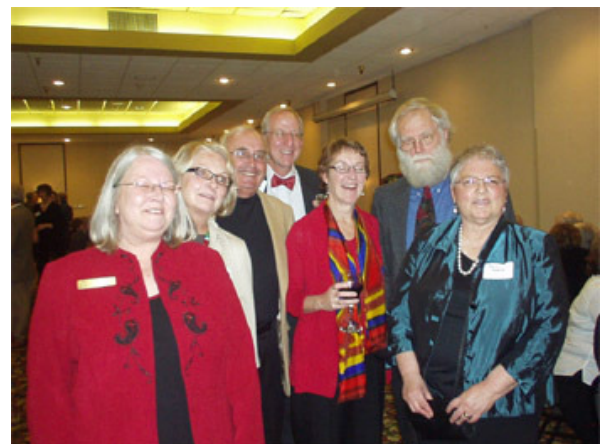
Pictured above is a group of SMAHC supporters from Willmar.

break the 200 mark in attendees - something we haven't done since our first Annual Celebration. We will be awarding a prize to the arts organization that brings the most members from their organization to the Annual Celebration. More information many more details will be put on our website ( www.smahc.org ) in the coming weeks and invitations with registration cards will be sent out in early October.