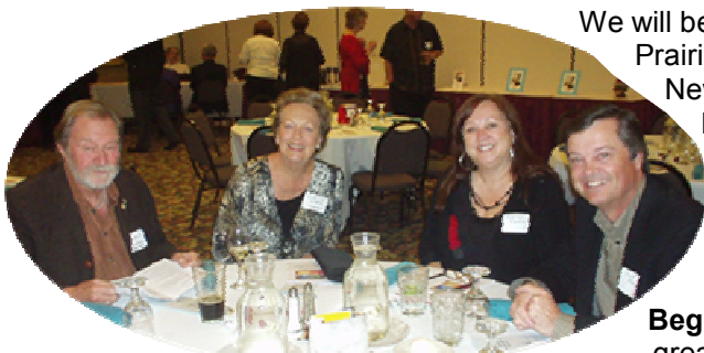
Pictured above is a group of SMAHC supporters from Pipestone.