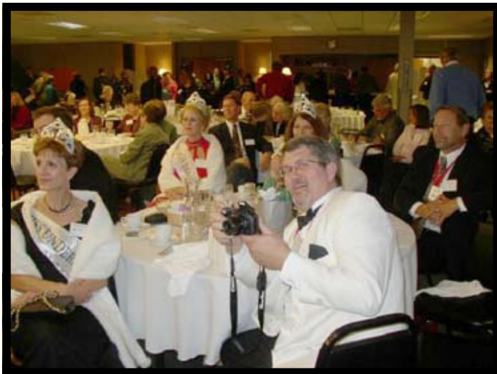
The Live Auction is in progress