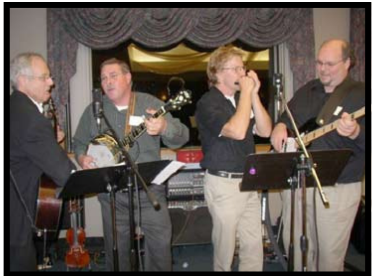
The Green Lake Bluegrass Band