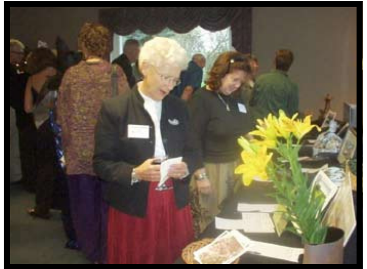
Guests visit the Silent Auction Tables