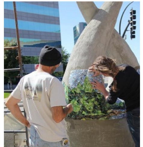
Paramount Visual Arts Team (who will create the Riverspace Passageway mosaic sculpture in New London) at work on "Tied to the River", a sculpture in downtown St. Cloud.

New London Arts & Culture Alliance , $16,000 for the Riverspace Passageway Project, which will create a mosaic sculpture near the Crow River as part of a broader community effort to revitalize the space.