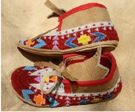
Moccasins made by Walter LaBatte, one of the instructors for the Dakota Wicohan apprenticeships.

ART PROJECT GRANTS provide organizations in the SMAC region with up to $5,000 in matching funds to stimulate and encourage the creation, performance and appreciation of the arts.